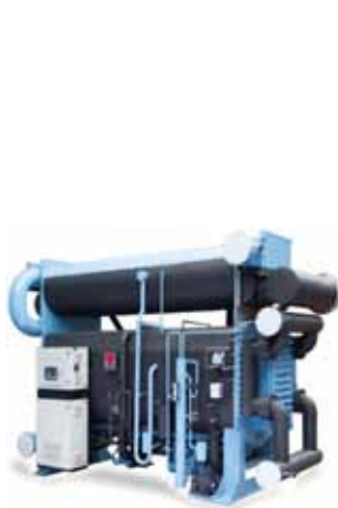
Ultra Low Pressure Vapour Driven Chiller