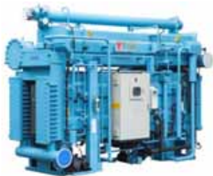
High Efficiency Chiller-Heater