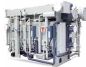
Triple Effect Chiller