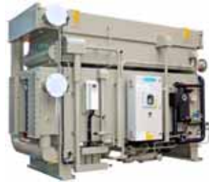
Sub-Zero Absorption Chiller